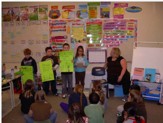
Students presenting their fundraising posters to other classes

We ended up collecting $230.16 in total. It ended up being an excellent math lesson as well, as the students worked on their own strategies for counting the totals from each classroom and then finding the grand total.