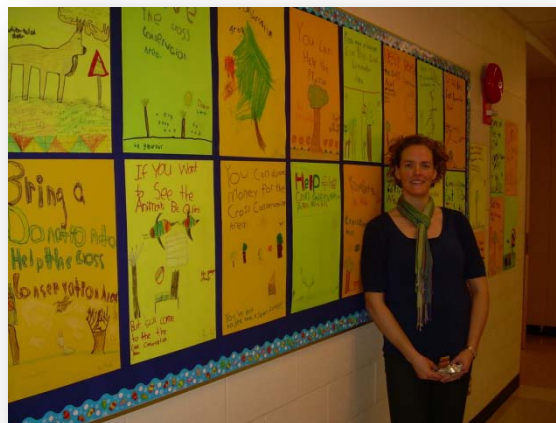
Proud teacher in front of their class posters